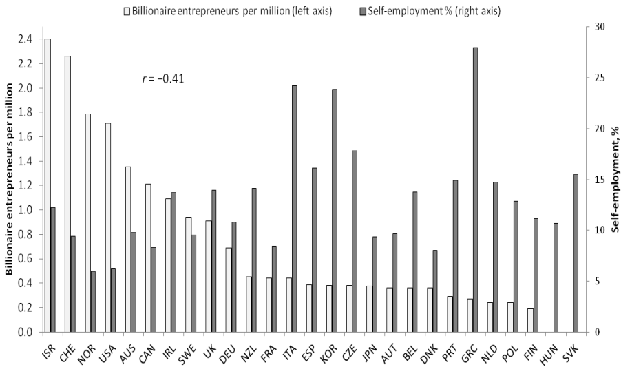
Figure 1 : The number of billionaire entrepreneurs relative to population and the non-agricultural self-employment rate in OECD countries.*

* The number of billionaire entrepreneurs relative to population is defined as No. of U.S. dollar billionaires per million inhabitants (defined as the 2010–2015 average) who have created their wealth by starting new firms and who appeared at least once on the Forbes list between 1996 and 2015. The non-agricultural self-employment rate is the average for 2010–2015.